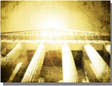
Pillar 1: “Passionate Prayer to God - Part 1”

Jesus said, “It is written, ‘My house shall be a house of prayer,’ but you have made it a den of robbers.” (Luke 19:46 ESV)